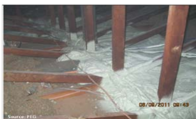
Application of membrane and spray foam to seal ductwork and air leakage pathway