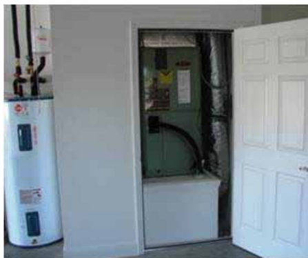
Conditioned handler unit closet access from garage

SunSmart SM homes include solar equipment for attic ventilation and water heating. Solar powered attic ventilation fans provide increased air movement through the attic space when attic temperatures would be at their highest.