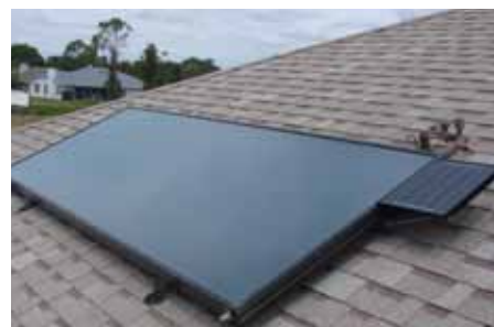
Active solar water heater with (PV) pump

rear the porch of the homes for easy maintenance.