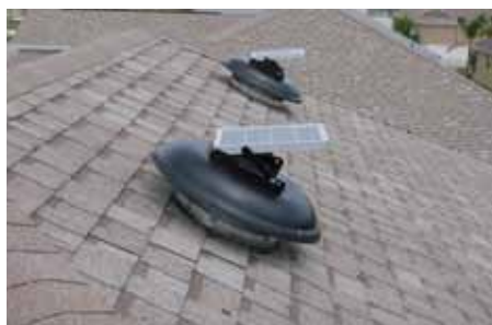
Solar powered attic fans

The air handler is installed in an air sealed and insulated closet accessible from the garage, providing a temperature-controlled environment to maintain indoor air quality standards.