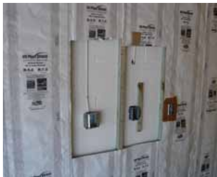
Double battens on block wall allows electric installation without creating penetrations in block

unit (inside component heating/air system). Located in the garage, the unit is air sealed and insulated to the conditioned temperature of the home. With this placement, the unit can function in a temperature-controlled environment and maintain indoor air quality standards. To further ensure a healthy interior environment through whole house ventilation, outside air is pulled into the base of the air handler unit. This air is pulled through a filter grill assembly located in the ceiling or