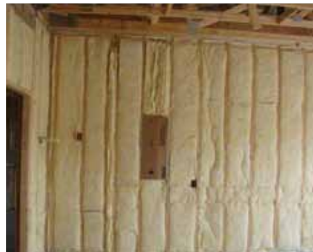
RESNET Grade 1 insulation on frame walls as required by the ENERGY STAR ® Thermal Bypass Checklist

Additional features in LifeStyle's SunSmart SM homes are extensive air sealing with long life caulk and foam, comprehensive placement of drainage planes, joints and connections and attention to window and door openings. All of these features, including properly installed insulation (no gaps, voids or compression - grade I) in the walls and attic, promote home durability and energy efficiency.