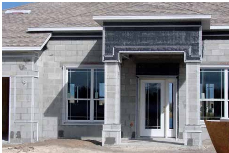
The Palm Bay Capri model, shown here before its completion in 2009, is LifeStyle Homes’ SunSmart SM Energy Initiative demonstration home.

LifeStyle’s commitment to high-performance homes led to the development of the SunSmart SM product line. SunSmart SM is an exclusive combination of better building techniques and higher-performance components that will deliver improved indoor air quality, comfort, durability, and energy cost – a fundamental goal of the Building America systems engineering process.