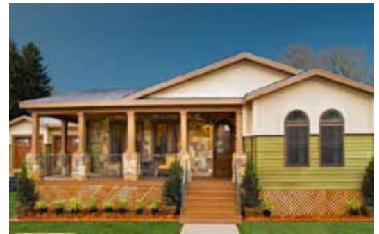
The Tularosa - 2009 IBS Show Village Home built by Palm Harbor Homes Tempe

Based on this existing partnership, new single-family homes that are certified Silver, Gold, or Emerald to the Standard can be concurrently certified to the U.S. Department of Energy's (DOE's) Builders Challenge.