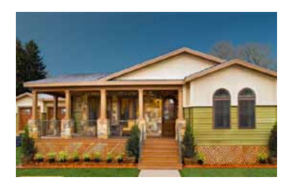
The Tularosa - 2009 IBS Show Village Home built by Palm Harbor Homes Tempe

Based on this existing partnership, new single-family homes that are certified Silver, Gold, or Emerald to the Standard can be concurrently certified to the U.S. Department of Energy's (DOE's) Builders Challenge.