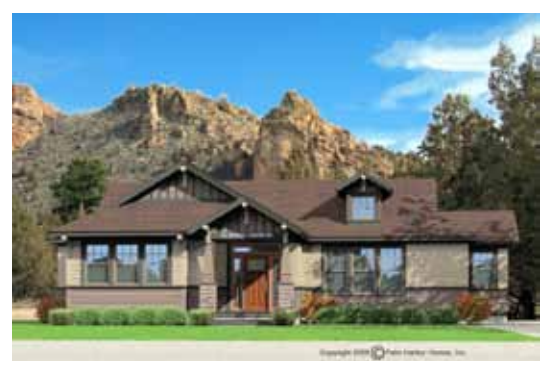
The Tularosa - 2009 IBS Show Village Home built by Palm Harbor Homes Tempe

To learn more about the Builders Challenge and find tools to help market your homes, visit www.buildingamerica.gov/challenge.